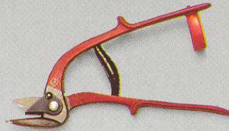
1A OWM 0631