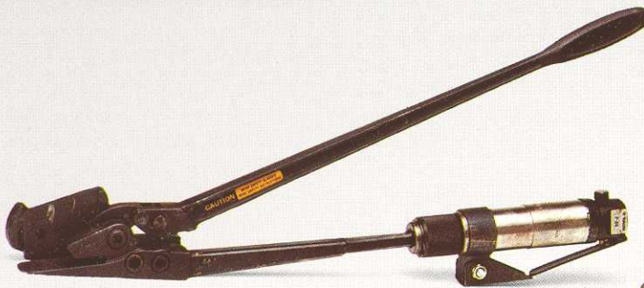
CU-25 MPH OWM 0623