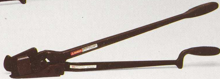
CU-25-S OWM 0633