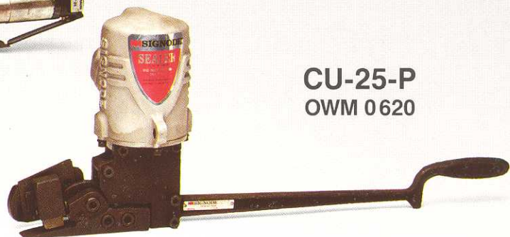
CU-25-P OWM 0620