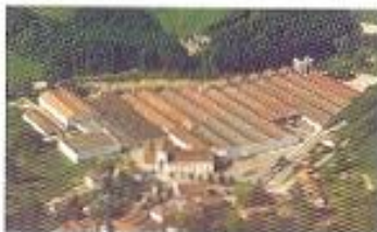
31-R 08220 URIMENIL - FRANCE

Dispenser - tensioner - buckles : please contact us