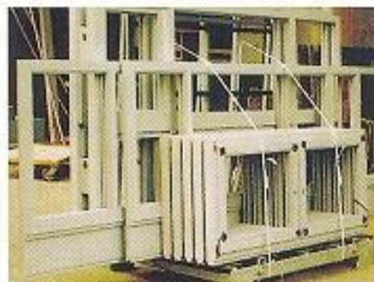
wood or PVC windows