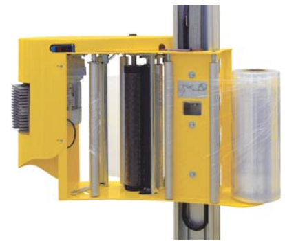
The Power Pre Stretch carriage is driven by belt lift and pre stretch wheels are easy to remove and change.